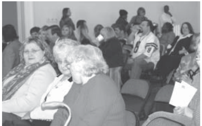
Over 150 guests, friends, and family members attended the 2006 Award Ceremony in Montgomery.